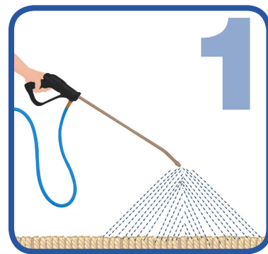
Spray Brush Pro Carpet Prespray onto soiled carpet.