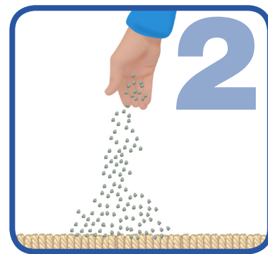
Sprinkle Brush Pro Dry Compound onto the carpet.